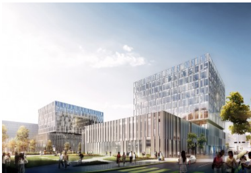
Green Valley Offices Shanghai/ China