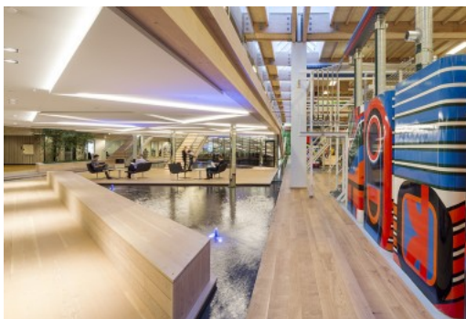
IBC Innovation Factory Kolding/ Denmark